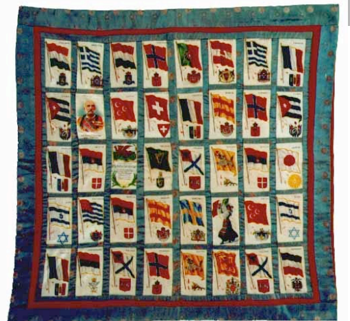
Table cover with patriotic silkies and red/blue borders 29" x 30" Silk novelties; silk sashing, borders, and backing

Installation mounted to wall, with pocket