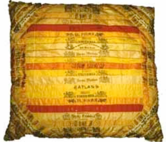
Pillow top made of 60 cigar ribbons (Reina Victoria, El Firma, Owl) 20" x 19" Silk ribbons; feather stitching (by hand) and zigzag stitching (machine)