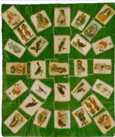
Pillow top of green sateen with individual silkies 21" x 18" Silk novelties on cotton sateen; herringbone stitching; cotton percale backing