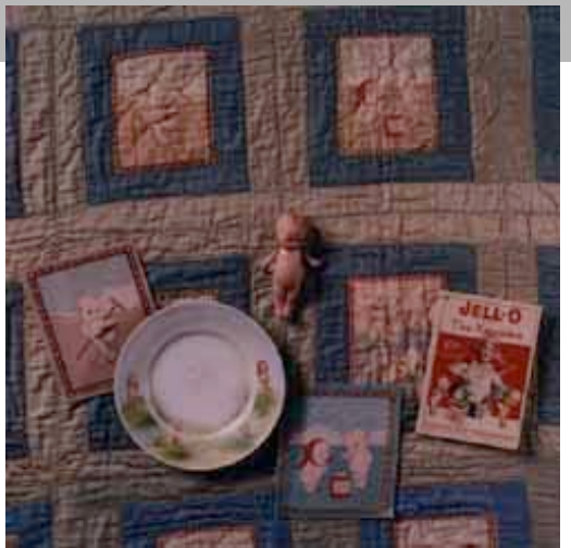
Jell-O and The Kewpies booklet 4 1/4" x 6 1/8" Paper

Installation Vitrine, next to Kewpie quilt 21