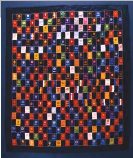
Throw of woven silk crests 50" x 58" Silk novelties alternating with silk and cotton fabrics; feather stitching; silk borders; replacement

Installation mounted to wall, with pocket