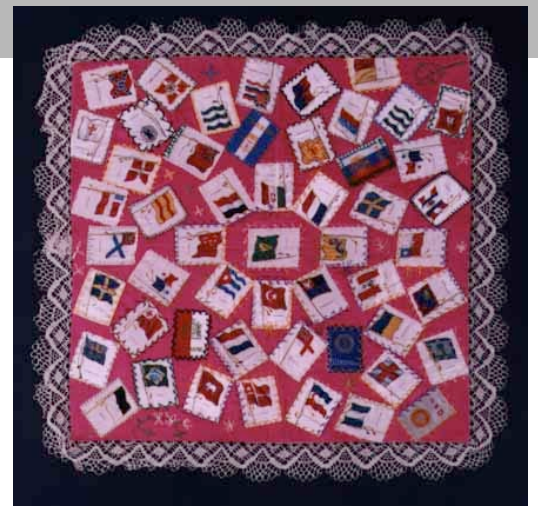
Table cover of pink sateen and individual silkies 20" x 21" Silk novelties on cotton sateen; decorative stitching; cotton lace ruffle; cotton