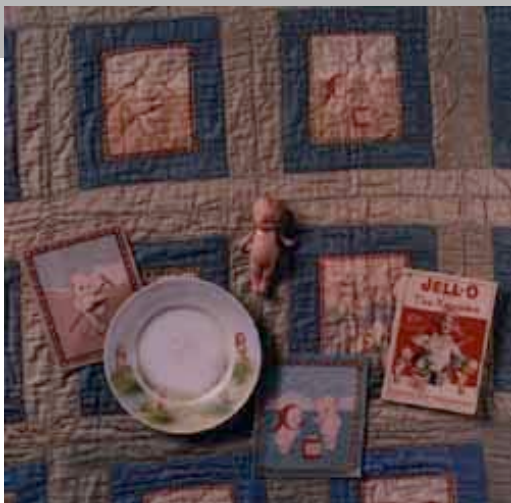
Kewpie harvesting cherries (brown) 5 1/4" x 6 1/8" Cotton flannel novelty

Installation Vitrine, next to Kewpie quilt 21