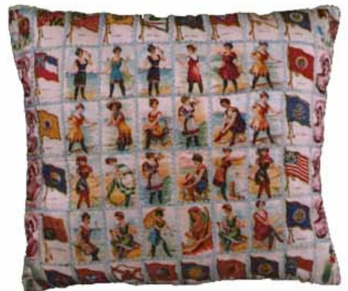
Pillow top with bathing beauties, flags, dogs, actress 17" x 15" Silk novelties; feather stitching; cotton sateen backing