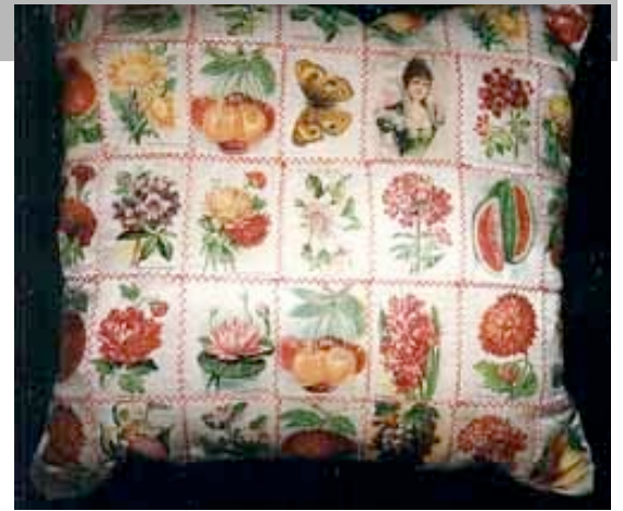
Pillow top with fruit, flowers, and Queen Mab 15" x 13" Silk novelties; herringbone stitching; cotton sateen backing