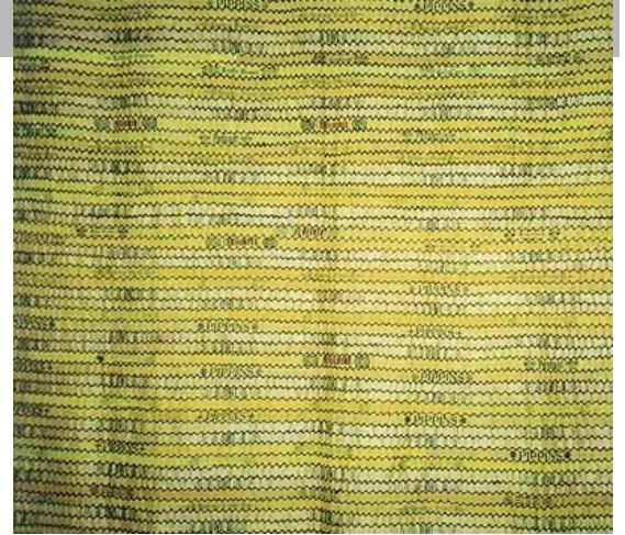
Parlor throw of yellow cigar silks 56" x 89" Silk cigar ribbons; herringbone stitching; replacement binding and backing

Installation mounted to wall, with pocket