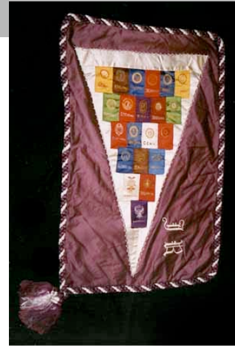
Pillow top of purple sateen and initials JR 27" x 17" Silk novelties on silk ribbon over cotton sateen; herringbone stitching; silk and cotton