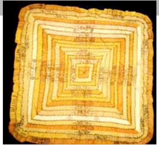
Table cover with ruffle edge 18" x 18" Silk cigar ribbons; feather stitching; tiered ribbon ruffle; cotton chintz backing