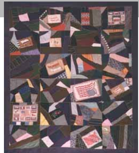
Bed comforter in crazy style with baseball, Indian, and flag flannels 78" x 90" Cotton flannel novelties; wool, silk, and rayon scraps; backing of