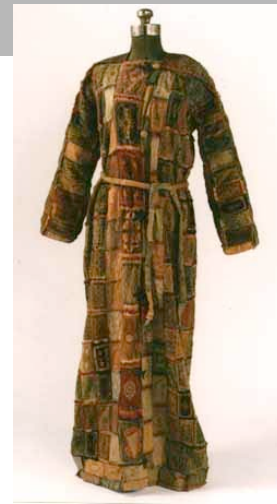
Woman's robe of miniature rugs Cotton velveteen and silk novelties with silk fringe; printed cotton flannel ground; silk lining