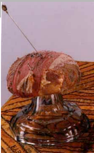
Pin cushion from kerosene lamp with actress silkie 6" high Silk novelty and fabrics; decorative stitching; pressed glass