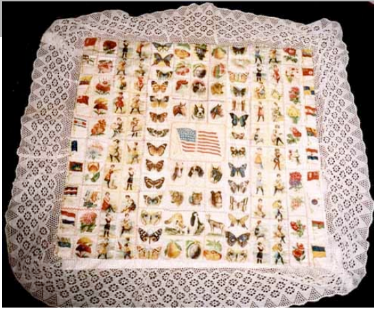
Table cover with center flag and large lace border 27" x 27" Silk novelties; feather and herringbone stitching; cotton lace ruffle; silk backing