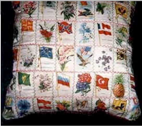
Pillow top with variety of silkies 15" x 15" Silk novelties; feather stitching; rayon satin backing