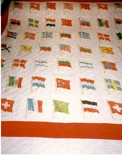
Quilt of flags with red/white/blue borders 70" x 82" Cotton sateen novelties; cotton broadcloth borders and backing; hand-quilted