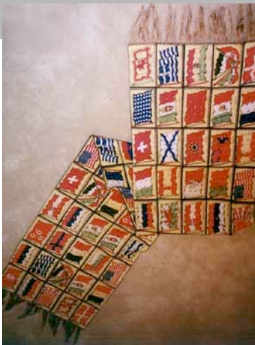
Tidy/scarf of flag flannels with fringe 72" x 15" Cotton flannel novelties; hand-knotted cotton fringe