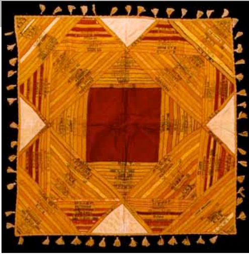
Table cover with red square center 36" x 36" Silk ribbons with silk fabrics; feather & herringbone stitching; cotton and silk passementerie trim;